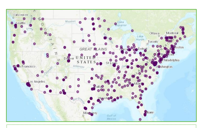
This ArcGIS map contains several layers of data useful for broadband deployment. Image: <u>Permitting Dashboard</u> <u>Broadband Map</u>

Nationwide broadband deployment will spur long-term economic growth and advances in health care, public safety, and more. This ArcGIS map contains several layers of data useful for deployment such as the location of national parks, protected wilderness areas, and lands of tribal significance. During the planning phase, this data may inform site selection, implementation, and scheduling decisions.